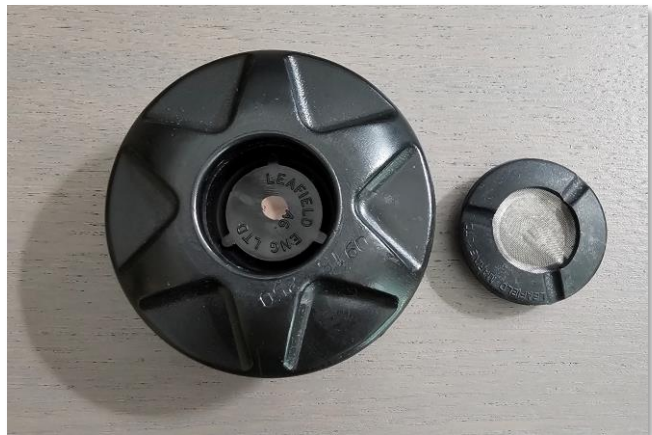
Pressure Relief Valve Seen beside filter cover