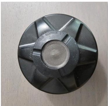
Pressure Relief Valve Seen with filter cover

Important note: as the environmental temperatures begin to lower after their afternoon peak, the unit may need to be refilled-topped off with air. This usually happens in warm climates following an extended period of outdoor use.