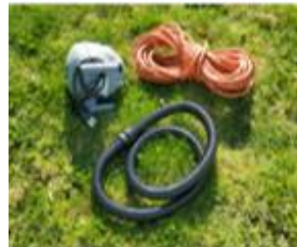
Shown GX-6 model