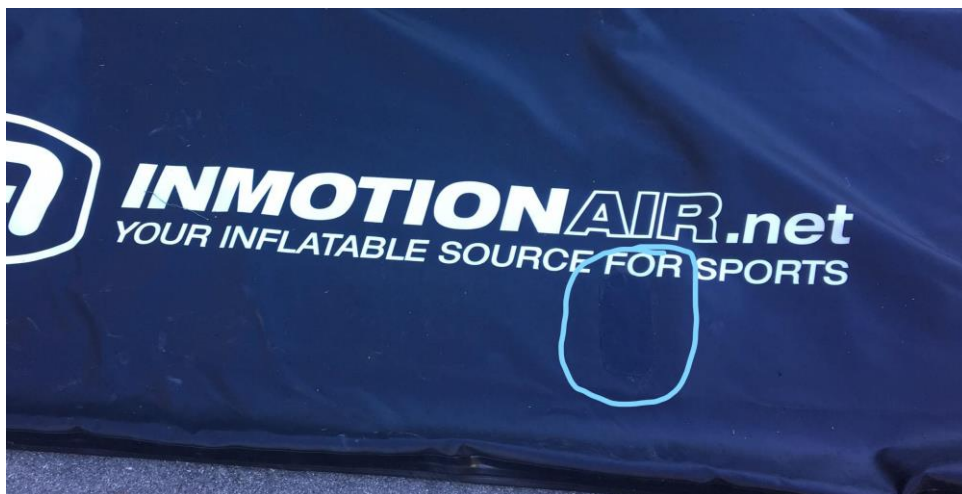
Exterior patch used in 2-layer sandwich patch shown in the circled area above in photo.

We've successfully repaired slices as long 6 inches caused by metal cleats coming down on a tube as well as larger holes the size of a 50 cent piece. These repairs require a 2-layer patch we refer to as a sandwich patch. Before attempting this patch, we recommend calling us for additional support. Basic supplies are the same as used for small hole patching.